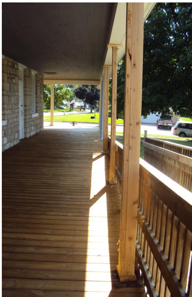
Temporary pillars in place along west side of hospital

Bernice Satter Rongstad Family in memory of O.E. Satter