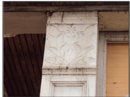
Exquisite details uncovered