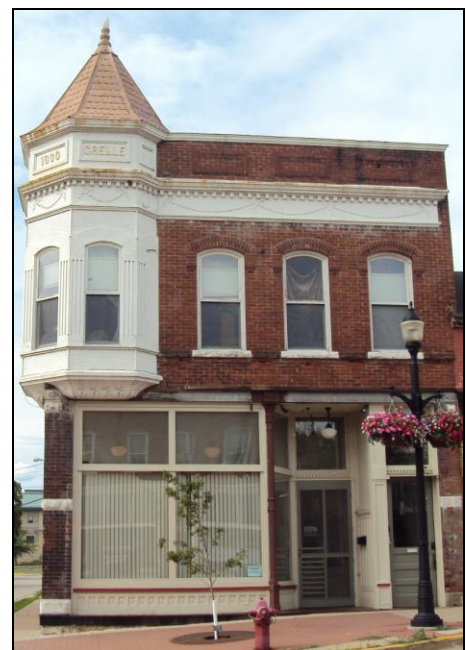
June 22, 2019